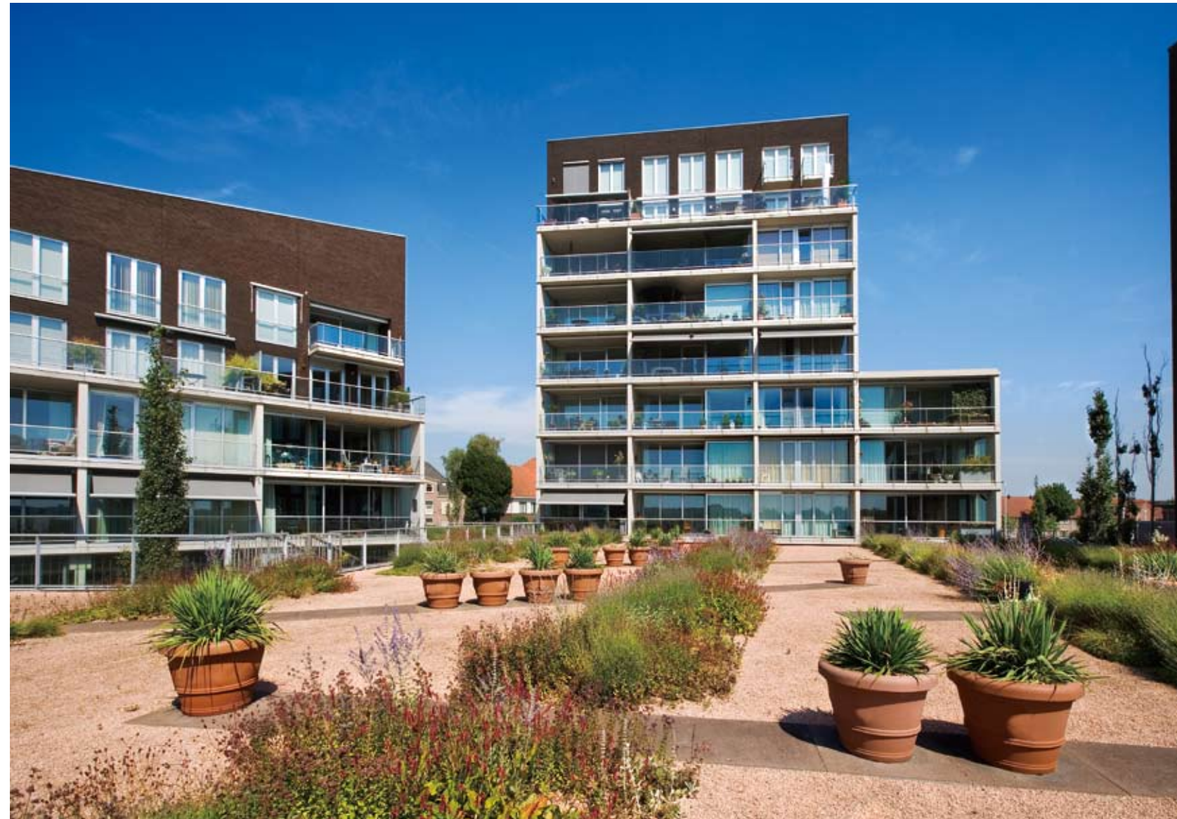
Upper left: The serpentine of the road relates to the river Lower left: The apartment complex is closely linked to the river Upper right: A series of roof gardens cover the parking garage Lower right: Repetition of cones create an intriguing pattern

左上：曲折的道路直通河边 左下：公寓楼和河流的关系十分密切 右上：车库上方的屋顶花园 右下：反复的锥形结构形成了有趣的图案